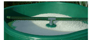
ROTATING SPRAY BAR OPERATING ON FLUIDISED BEARING COMPLETELY MAINTENANCE FREE