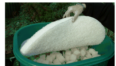
TRICKLE TOWER EXTENSION SHOWING COVER SHEET AND BIO CUBES